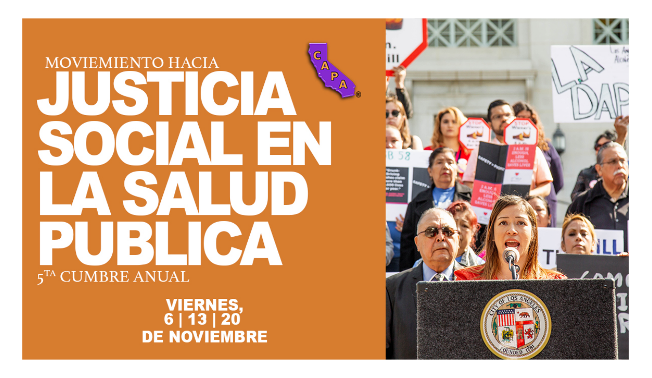
California Alcohol Policy Alliance is a project of Alcohol Justice

For more information on CAPA, go to: <u>https://alcoholpolicyalliance.org/</u> and follow on: Twitter @CAPA_Alcohol Instagram @caalcoholpolicy Facebook @AlcoholPolicyAlliance