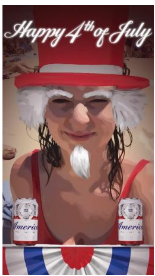
Bud's sponsored Snapchat lens marked a beer first

Some alcohol marketers are using lenses and filters fairly aggressively. A-B InBev on the Fourth of July created the first-ever Snapchat lens for a beer brand. It imposed a Budweiser branded Uncle Sam image over selfies. In May, the brewer ran a national Snapchat filter for Lime-A-Rita for Cinco de Mayo, which it said generated 64.8 million views.