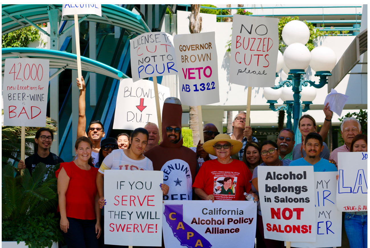
AB 1322 Protestors at Drybar Brentwood in Los Angeles, CA

The public is encouraged to take action at <u>AlcoholJustice.org</u> to tell legislators and Governor Brown to stop subsidizing alcohol-related harm by relaxing regulations. Instead, they should protect public health and safety and reduce alcohol-related harm in California by stopping AB 1322. Alcohol must never be served in a California retail or service establishment without a license.