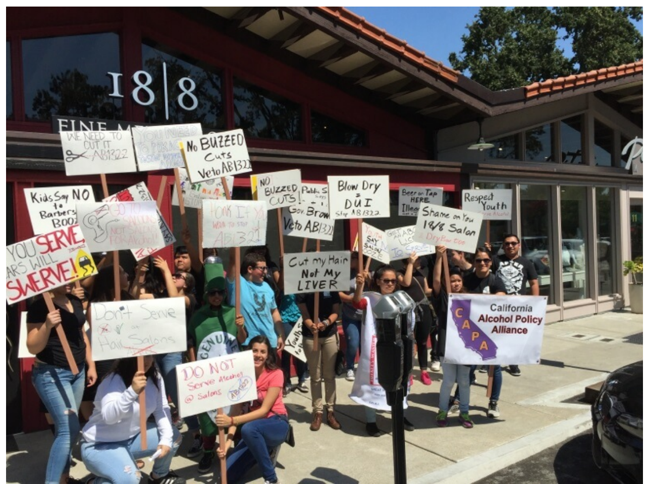
AB 1322 Protestors at 18/8 in Lafayette, CA