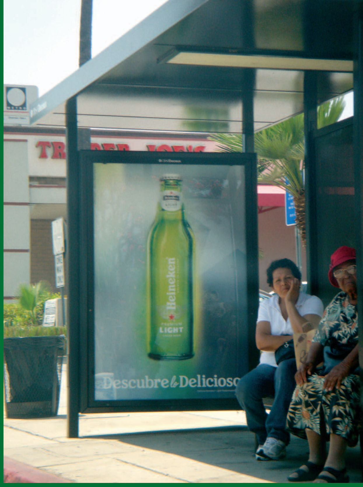
Los Angeles County bus shelter

Disclaimer: The information contained in this guide is not offered or intended to constitute legal advice. When finalizing any policy related to the strategies described we strongly recommend obtaining legal advice from a licensed attorney or government counsel in your local jurisdiction.