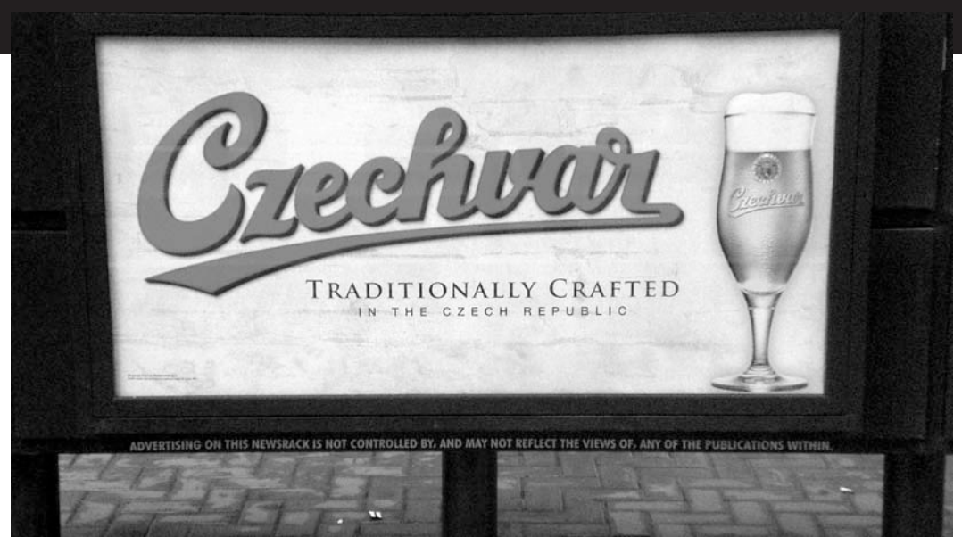
San Francisco news rack