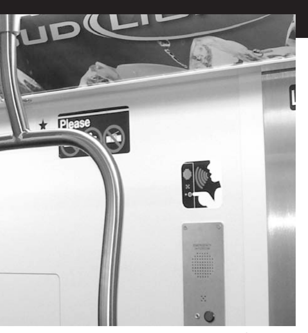
New York City subway