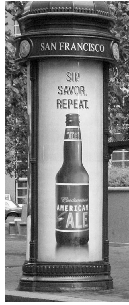
San Francisco news stand